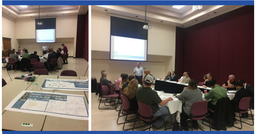
Stakeholders identified economic development areas, bottlenecks and chokepoints in Oklahoma using state rail maps.

ODOT Commission Room 200 NE 21st Street Oklahoma City, OK 73105